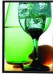
Black Square Corners