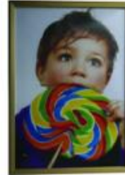
Gold Square Corners