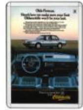
Silver Round Corners