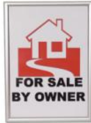
Silver Square Corners